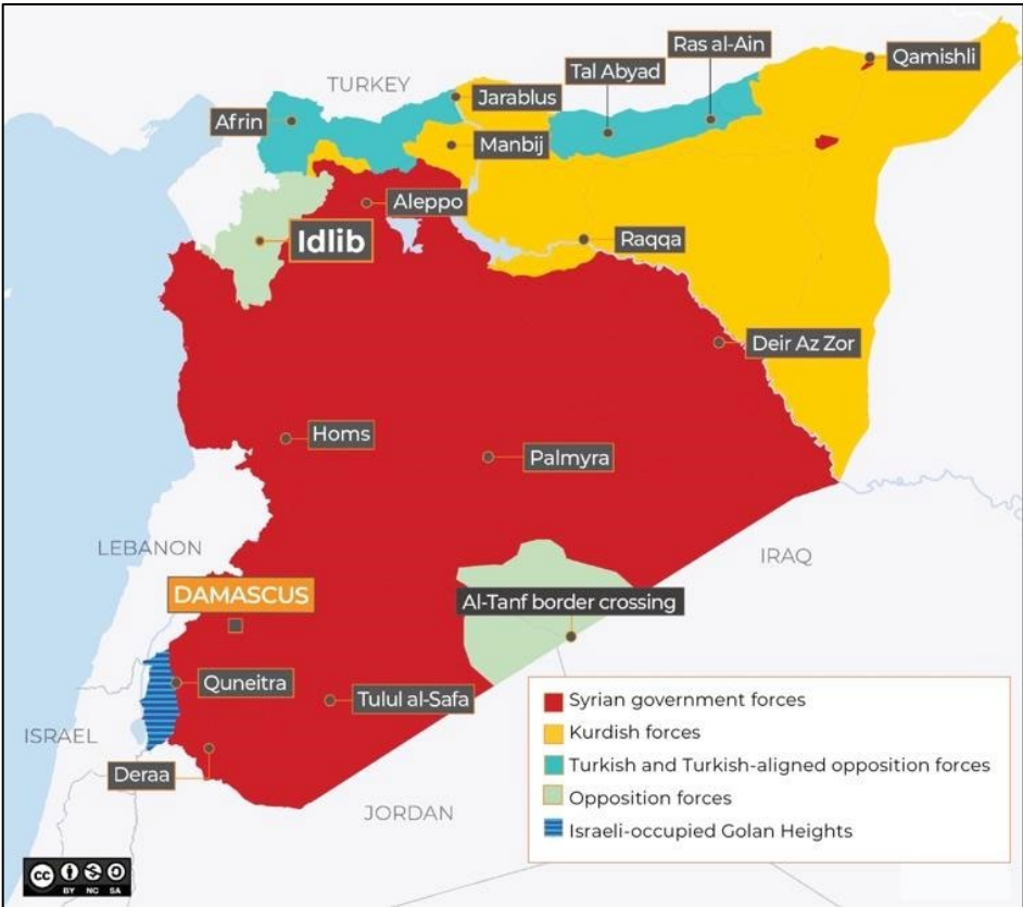
Figure 1 Map of Divisions in Syria

(NES) and, Central Syria. Organizations providing services in Syria operate within the scope of these boundaries, including the international humanitarian aid mechanism that has developed coordination hubs based on these three geographic divisions.